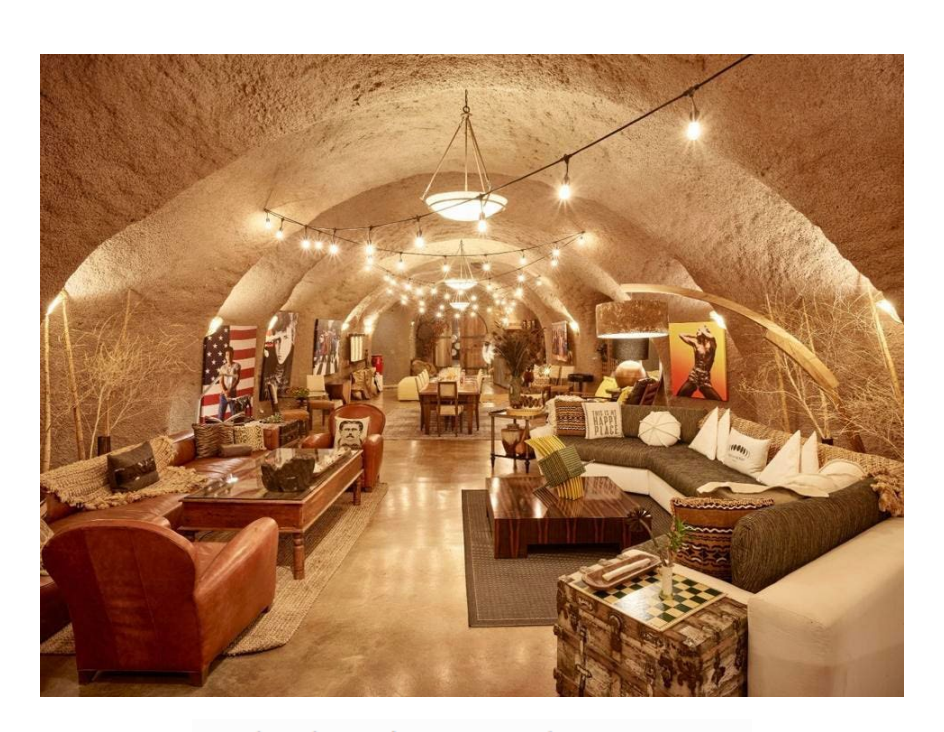
B. Wise Vineyards Estate tasting room B. WISE

They are under the leadership of a Master Chef who comes with them. In our program, I fly the students down to Sonoma for five days to cook and learn more about wine, all as they work to plan this grand dinner for our wine club members. During the days, I take them around to visit famous wineries and restaurants in the area so that they can learn about wine country hospitality from the very best.